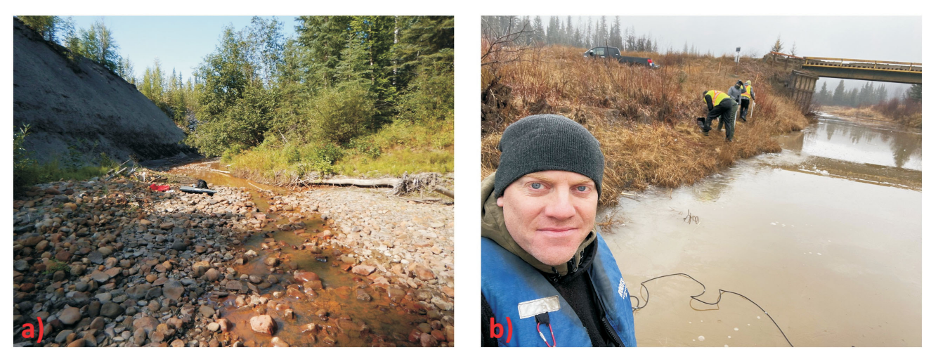
Figure 3. Examples of benthic invertebrate sampling at a) Alexander Creek and b) Blueberry River.

Climate data will be used to assess the water balance at each of the monitoring sites. Climate data parameters include total accumulation of precipitation and snow, air temperature, wind speed and direction, barometric pressure, and relative