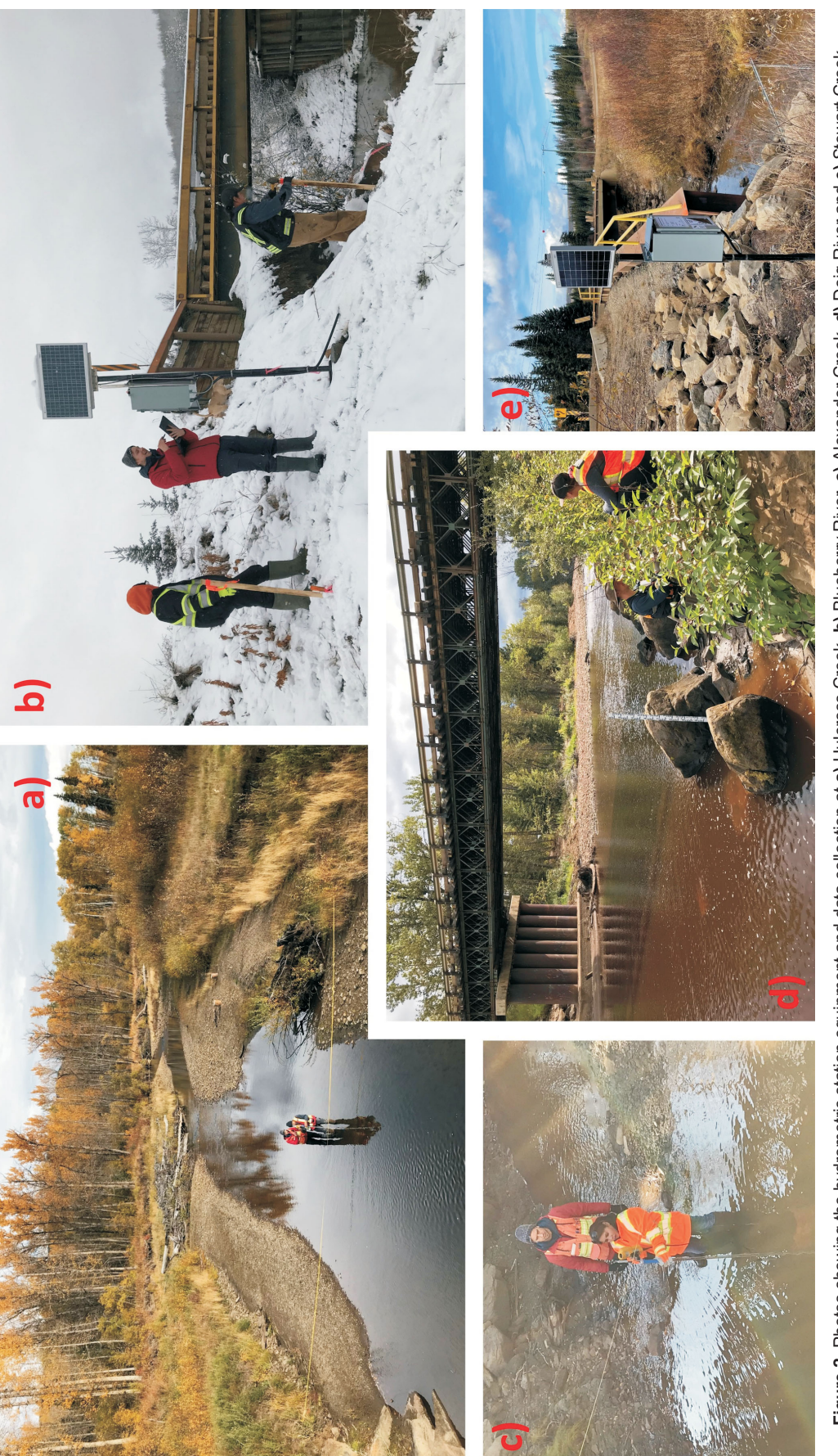
Figure 2. Photos showing the hydrometric station equipment and data collection at a) Hulcross Creek, b) Blueberry River, c) Alexander Creek, d) Doig River and e) Stewart Creek.